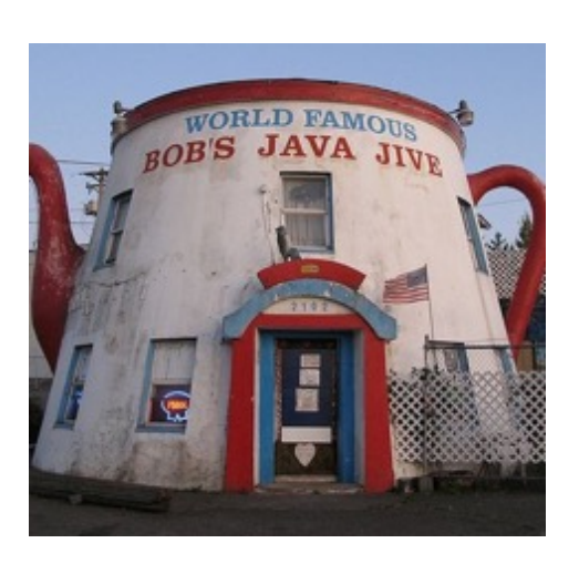
(This is an example of a landmark which is just a name of a building.)