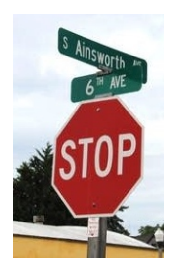
(This is an example of cross streets.)

Every TFD fire engine and ladder company is staffed with 3 EMT's. Some companies are also staffed with a paramedic.