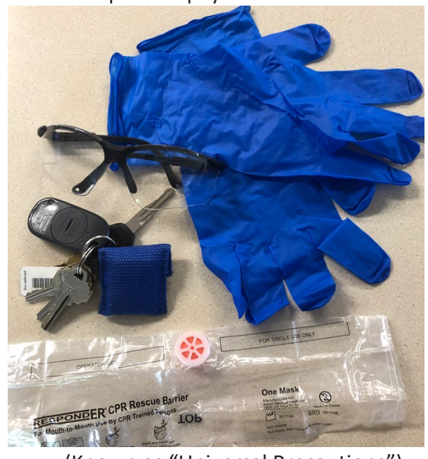
(Known as "Universal Precautions")